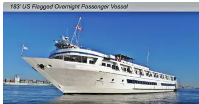
183' US Flagged Overnight Passenger Vessel